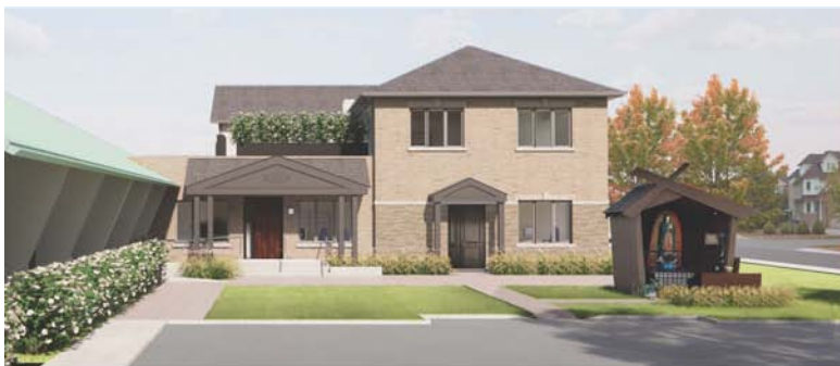
EXTERIOR VIEW - OFFICE FRONT