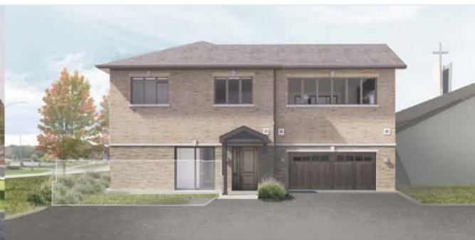
EXTERIOR VIEW - RECTORY